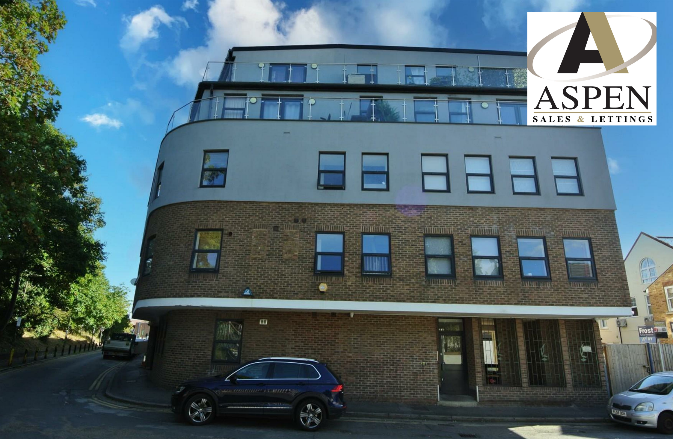
Ash House 1-3 Station Road, Ashford, TW15 2UW